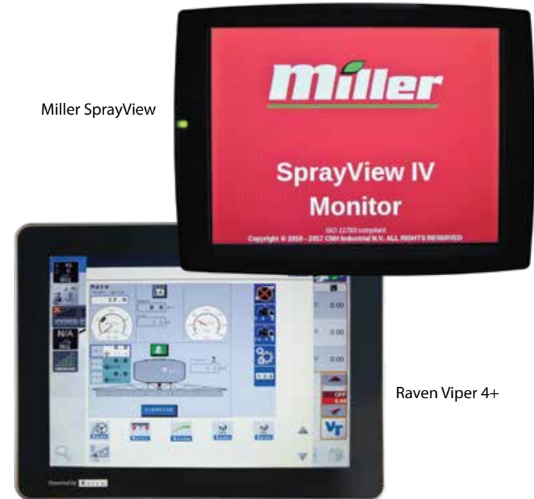
Raven Viper 4+