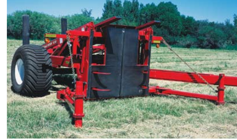
The Auto Align® system allows the operator to pick up bales in the same direction as the field was baled (12SR model shown).