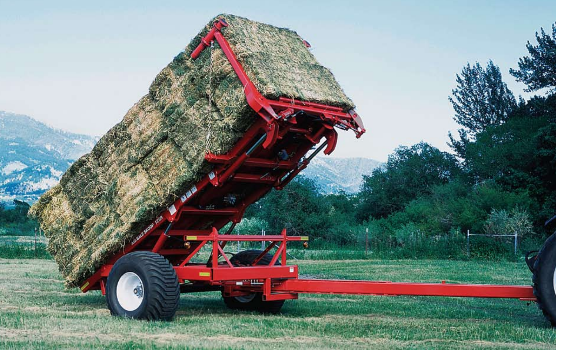
Well designed and built for demanding conditions. Stacks are aligned both vertically and horizontally for easy loading onto a truck. Heavy wall tubing and custom designed cylinders provide the strength and performance you require year after year.