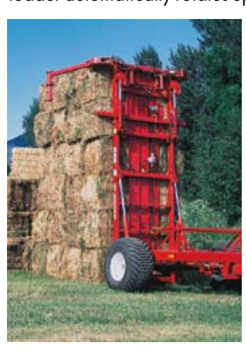
Once the bed is vertical, the alignment arms are opened, and the 12SR is driven forward to remove the teeth from under the stack

Automatic grab hooks hold the first bale in position, without dragging the bale, allowing the alignment arms to reopen to engage the second bale. The loader automatically rotates up as the two bales are