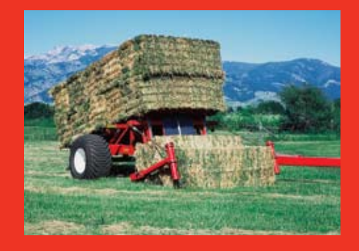
ProAG Auto Align® Bale Skoops are designed for dairy farmers, hay growers and custom operators. They are built tough with exacting attention to detail to maximize your time and productivity.